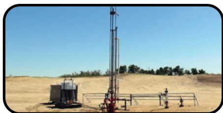
WELL HEAD EQUIPMENT

SilverJack built-in optimization capabilities allow for the freedom to quickly respond to changing flow dynamics without expensive and labour-intensive manual processes. The result is an intelligent artificial lift system that maintains peak efficiency while increasing production and decreasing downtime.